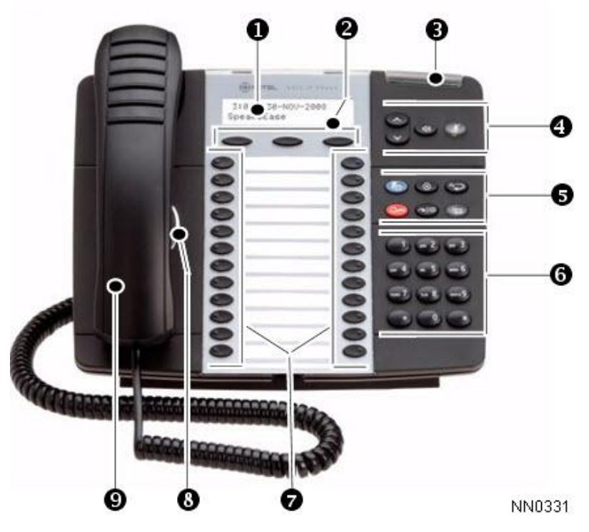
5324 IP Phone